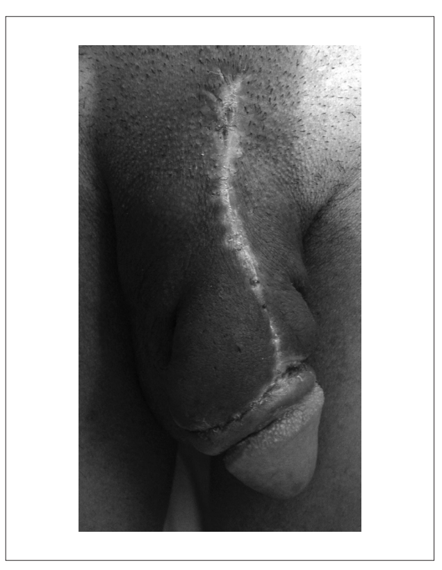
Figure 5. Penis appearance two months after surgery.