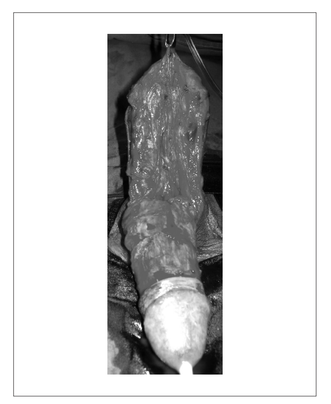
Figure 3. Resection of the mass and excess skin.