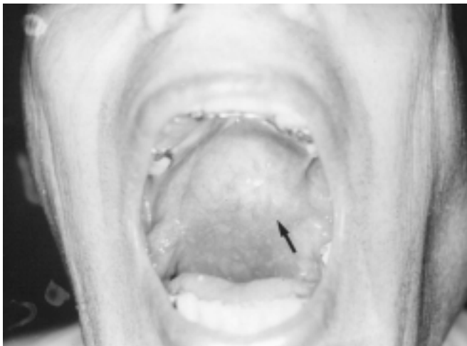
Figure 1 - Patient with pleomorphic adenoma of parotid gland bulging into the oropharynx (arrow).

As mentioned earlier, most tumors were benign and minimal surgical morbidity was