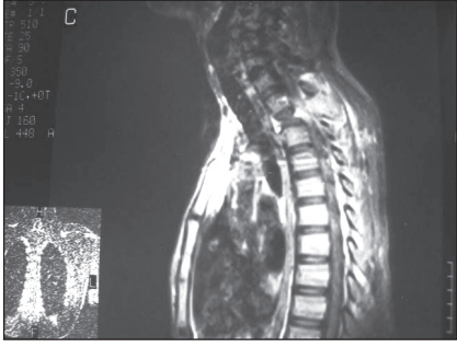
Figure 2. Sagittal T1-weighted gadolinium-enhanced magnetic resonance image showing compression fracture of the T2 vertebral body with severe spinal cord compression, in a young man with hemangiopericytoma.