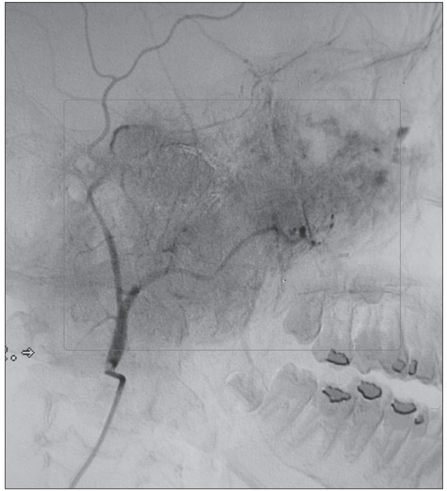
Figure 2. Magnetic resonance imaging of a twelve-year-old patient, showing solid mass with isodense contrast in T1.

vincristine, actinomycin and cyclophosphamide and one of iphosphamide and vepeside. Subsequently, he received further irradiation via linear accelerator because of endocranial infiltration. The tumor responded to the last irradiation, with local control of the disease, and the patient remains asymptomatic until the present date.