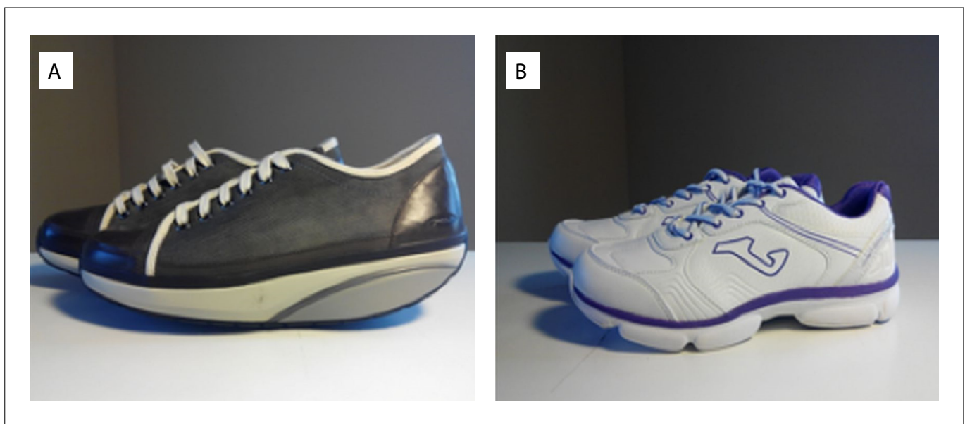
Figure 2. Unstable shoes (A) and conventional shoes (B).

Values are mean ± standard deviation unless otherwise indicated.