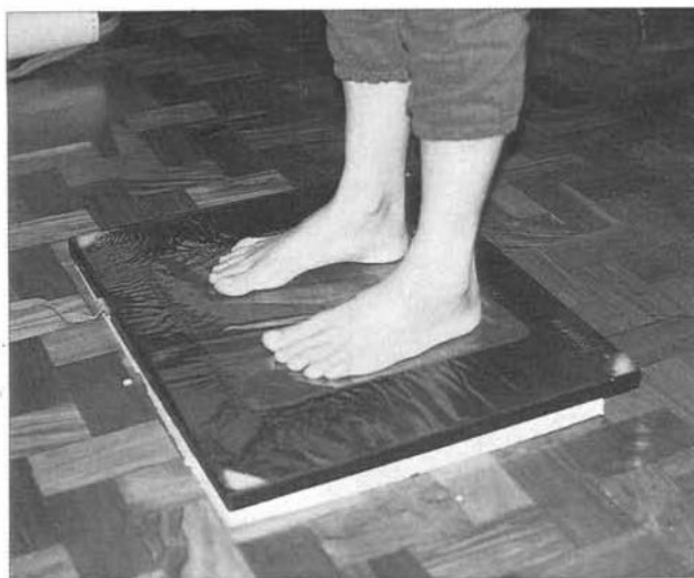
Figure 1 – Plataform and test performance.

We also performed a qualitative analysis of the data obtained. The following variables were used: asymmetry between the two feet, verified by means of visual analysis of the printed plantar maps; confrontation of areas with observed clinical sensation impairment with areas of increased pressure and the findings of pressure increase in anomalous portions of the foot, by means of comparison with the control group; presence of the increased pressure concomitant with plantar ulcers and changes in foundation surfaces.